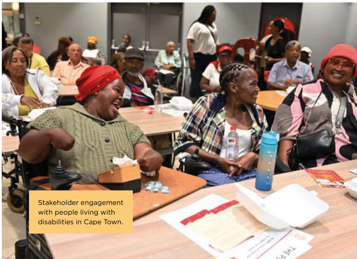
Stakeholder engagement with people living with disabilities in Cape Town.

The Public Protector South Africa (PPSA) holds roadshows annually for each province. These visits are planned in advance, and a report with specific information about the province is prepared. The Public Protector herself attends these roadshows. During the visits, they meet with local government representatives to discuss specific reports, and they also hold meetings with non-governmental organisations to address challenges encountered on the ground and explore potential partnerships. Unannounced visits, such as to hospitals, are sometimes part of the roadshow. At the conclusion of the visit, they meet with provincial government officials to provide feedback based on their findings during the roadshow. This proactive approach helps prevent a flood of complaints about the same issues. Occasionally, these roadshows lead to systematic investigations.