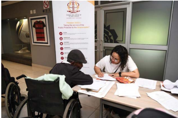
Stakeholder engagement with people living with disabilities in Cape Town.