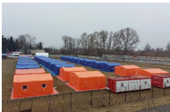
Siret-Porubne Border crossing, March 2022.