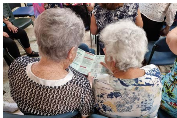
Outreach activity for older persons.