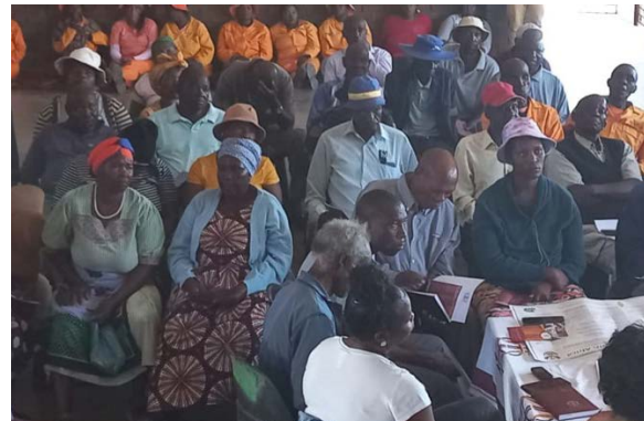
Stakeholder engagement with the elderly in Limpopo Province.