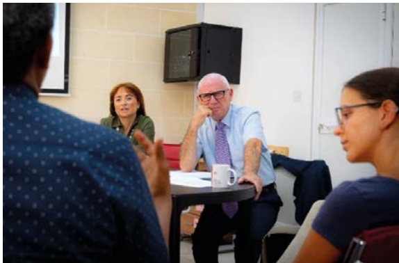
The Parliamentary Ombudsman of Malta, Judge Joseph Zammit McKeon, during a meeting with refugees.

The Ombudsman of Malta also met with ambassadors accredited to Malta, representing communities with significant populations in the country. These discussions emphasised the office's commitment to ensuring its services are accessible. Not only to Maltese and European nationals, but also people from other countries, reflecting an inclusive approach to upholding fairness and justice. The meetings with ambassadors provided opportunities to raise awareness about the Ombudsman's responsibilities while strengthening relationships with stakeholders to promote a more transparent and accountable public service. By addressing concerns directly and fostering trust, the office of the Ombudsman of Malta continues to position itself as a key advocate for equity and good governance.