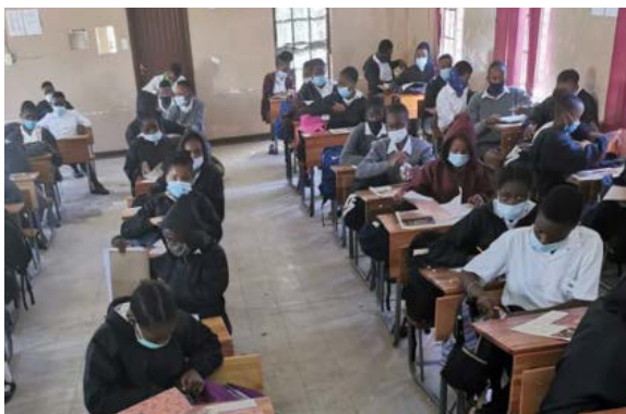
Stakeholder engagement with youth/scholars in Eastern Cape and Limpopo Provinces.

At present the Ombudsman office Sindh uses beside social media, website, workshops and seminars, open house meetings to disseminate information regarding the work of their office. Besides that, the Ombudsman Sindh also established regional offices at district level of the province, covering far-flung areas. The concerned regional directors hold public meetings, site visits and communicate with society through NGO's, seminars and other such awareness activities.