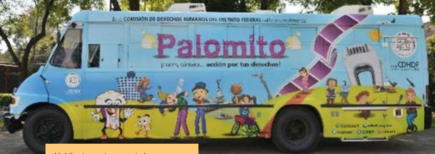
Mobile cinema to promote human rights activities among girls, boys and adolescents in schools and other spaces.

The Ombudsman Rotterdam-Rijnmond (ORR) in the Netherlands has also introduced the 'Ombulance'. The term 'Ombulance' combines 'Ombudsman' and 'ambulance' because they, as an institute, also provide assistance in legal or bureaucratic emergencies, similar to how an ambulance handles medical emergencies. They refer to it as "First Aid for Bureaucratic Accidents". With this mobile office, they bring assistance to the people and are ready to talk to people on-site. What makes the 'Ombulance' special is that it emphasises the need for human contact in a time when municipalities are increasingly digitising, and the distance between government and citizens seems to be growing. The 'Ombulance' can regularly be found at various busy locations in the city and the surrounding municipalities.