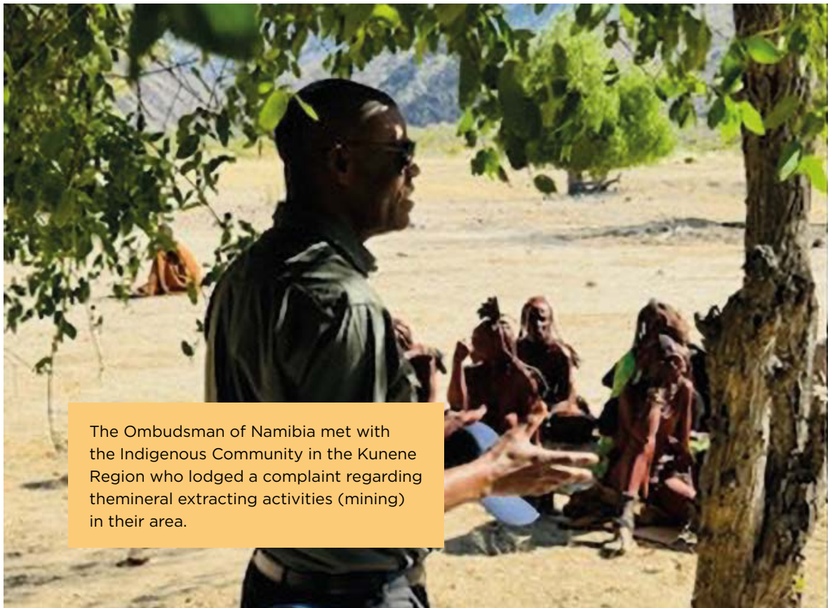
The Ombudsman of Namibia met with the Indigenous Community in the Kunene Region who lodged a complaint regarding the mineral extracting activities (mining) in their area.