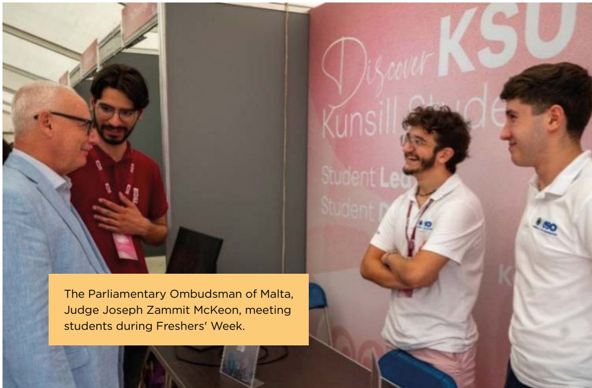
The Parliamentary Ombudsman of Malta, Judge Joseph Zammit McKeon, meeting students during Freshers' Week.