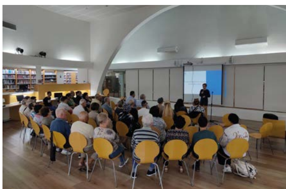
Outreach activity for the Bedouin community.

Despite the voluntary nature of the involvement of intermediaries, some (Ombudsman) institutes compensate them financially for their efforts. The Parliamentary and Health Service Ombudsman (PHSO) of the United Kingdom, for example, has chosen to compensate the intermediaries they work with financially. The consideration for compensating these (voluntary) parties is mainly based on the enormous efforts they make. Working with intermediaries offers a lot of possibilities for Ombudsman offices to reach out to their public and to get informed about important issues in (specific parts of) society. 12 Whether it is ethical to compensate these parties financially is perceived differently by different Ombudsman organisations.