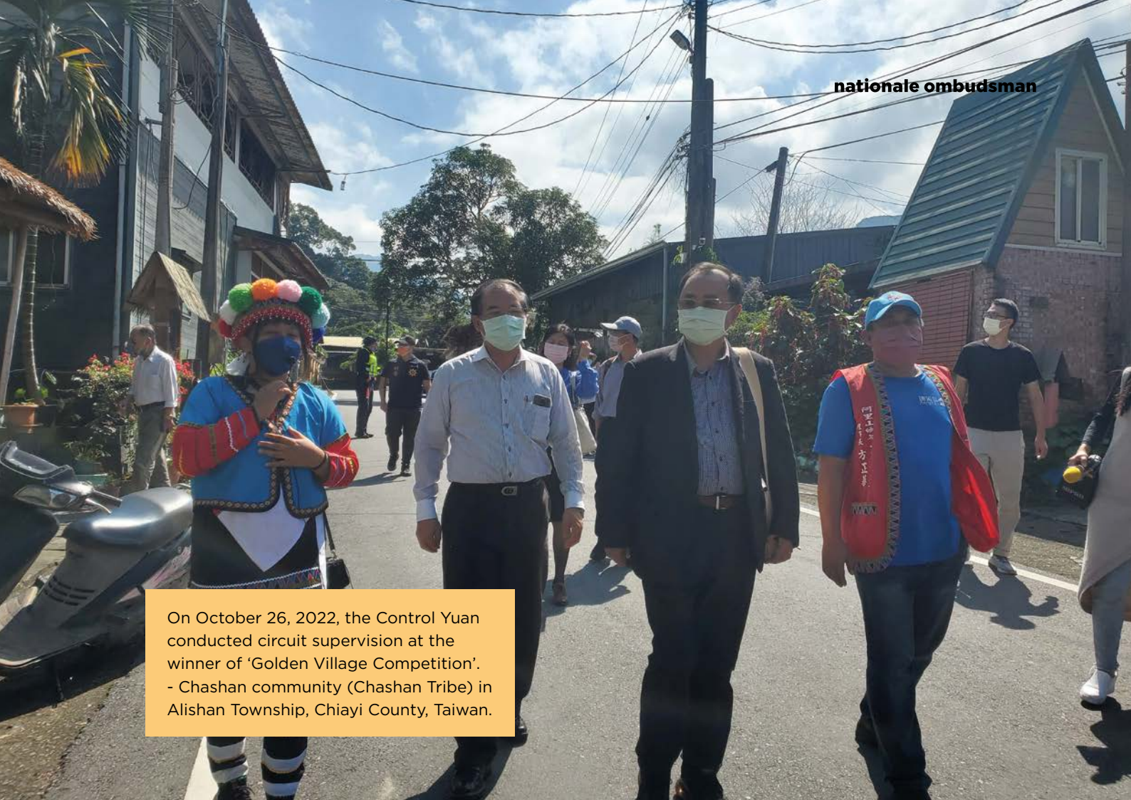
On October 26, 2022, the Control Yuan conducted circuit supervision at the winner of 'Golden Village Competition'. - Chashan community (Chashan Tribe) in Alishan Township, Chiayi County, Taiwan.