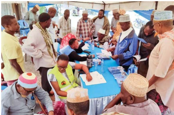
Awareness campaign of the Ombudsman of Kenya.

According to the office of the Ombudsman of Kenya, collaborating with NGO's and civil society groups not only allows the office to extend its reach and engage with communities more effectively, but these partnerships also focus on joint advocacy, awareness campaigns, and capacity-building initiatives.