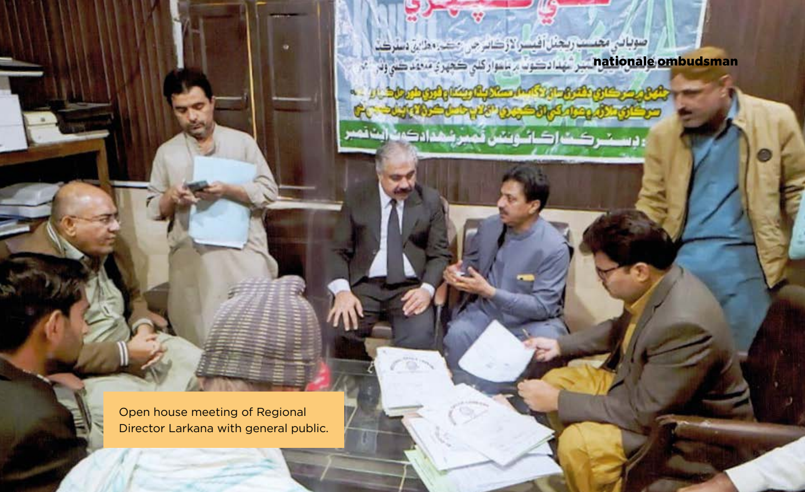
Open house meeting of Regional Director Larkana with general public.